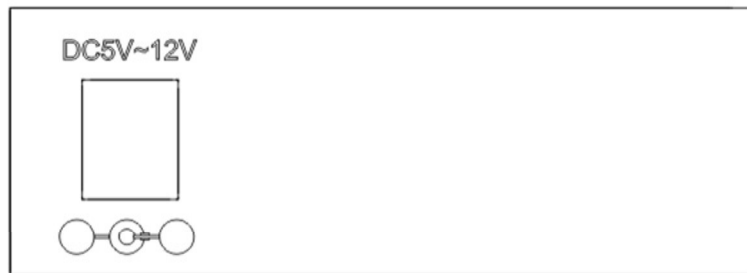
Fig.3 Rear panel