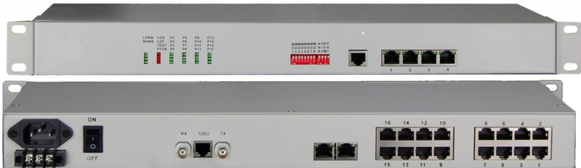
19inch 1U type